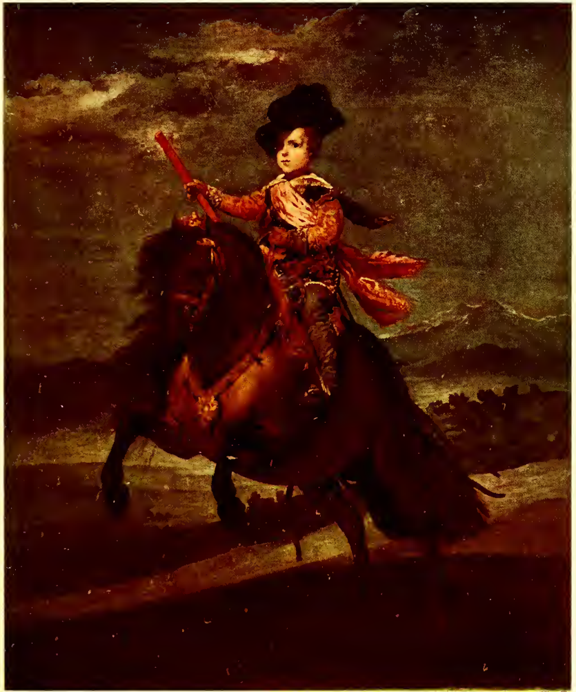
DON BALTHAZAR CARLOS.

From the picture by Velasquez, in the Prado Museum, Madrid.